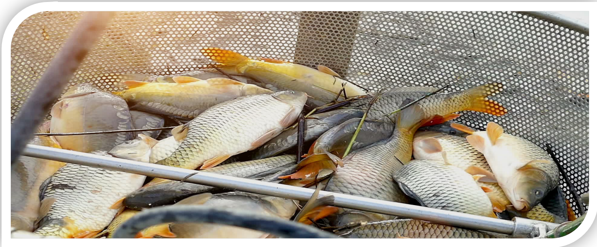
Fish and greens (tomato & cabbage) from our out-grower schemes