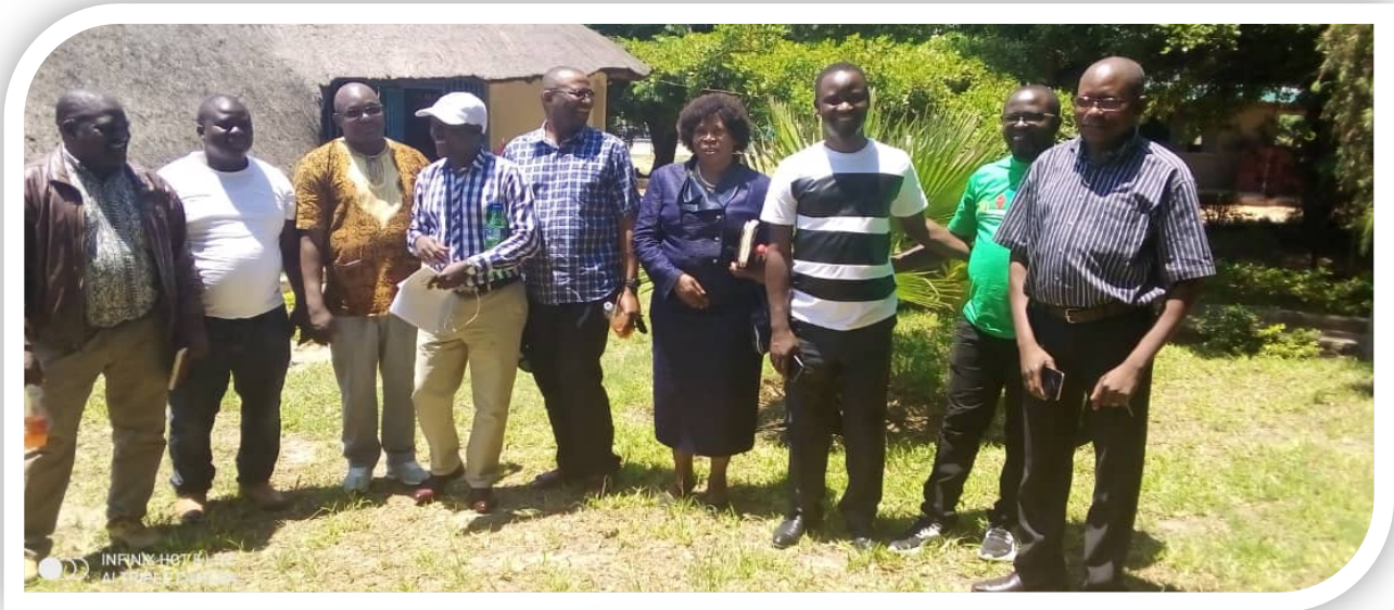
Stakeholders meeting over progression of fingerling production in Shiwangandu.